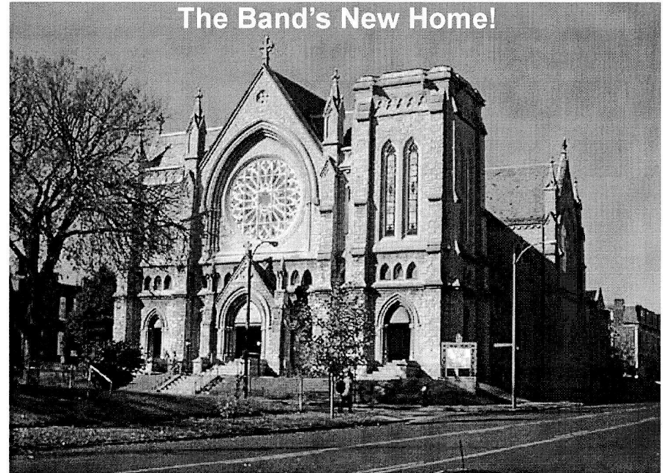
Immaculate Conception / St. Henry's Architect: Barnett, Haynes & Barnett

In addition to weekly Band rehearsals, members devote thousands of volunteer hours at bingo at Bandwagon Hall on Friday and Saturday nights throughout the year. The Band is also financially supported by the Adam's Mark Hotel, Clifford Willard Gaylord Foundation, Foot and Ankle Associates, Missouri Arts Council, Regional Arts Commission, Southwest Bank, St. Louis Parks & Recreation Department, Tower Grove Manor, and Bandwagon Members.